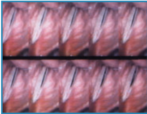
View of the vocal folds using strobovideolaryngoscopy to reveal slight asymmetry responsible for lack of vocal fold closure and breathy singing voice quality.