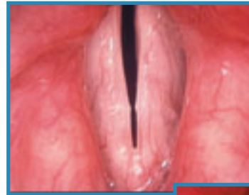
Pre and post treatment for a patient with vocal fold nodules.