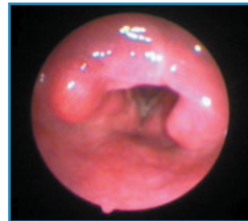
Endoscopic view of a larynx injured by acid reflux.

Patients who complain of difficulty or pain when swallowing liquid, food or medications or suffer from frequent choking during meals may benefit from a swallowing examination. This also includes patients having a history of swallowing difficulty related to acid reflux disease (heartburn), Parkinson’s Disease, Cerebral Palsy, Multiple Sclerosis or ALS (Lou Gehrig’s Disease). Swallowing problems may also develop after sickness, surgery or changes in medications.