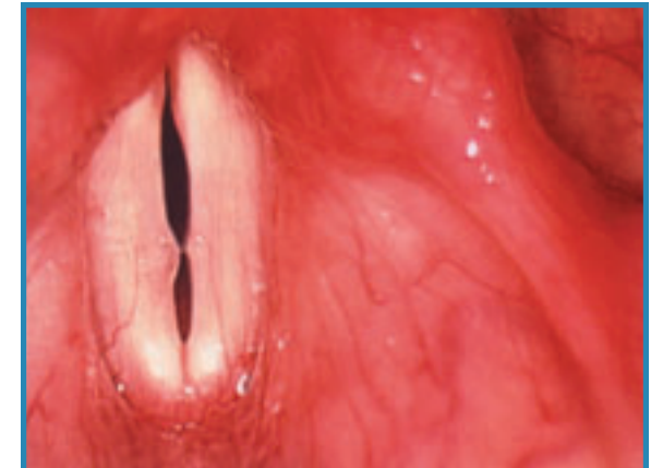
A close up view of the vocal folds taken in the office showing a small polyp on the right vocal fold.

The Center consists of a team of nationally recognized individuals, state of the art diagnostic technology and the resources of New York Presbyterian Hospital to offer comprehensive and complete care of the voice and swallowing systems.